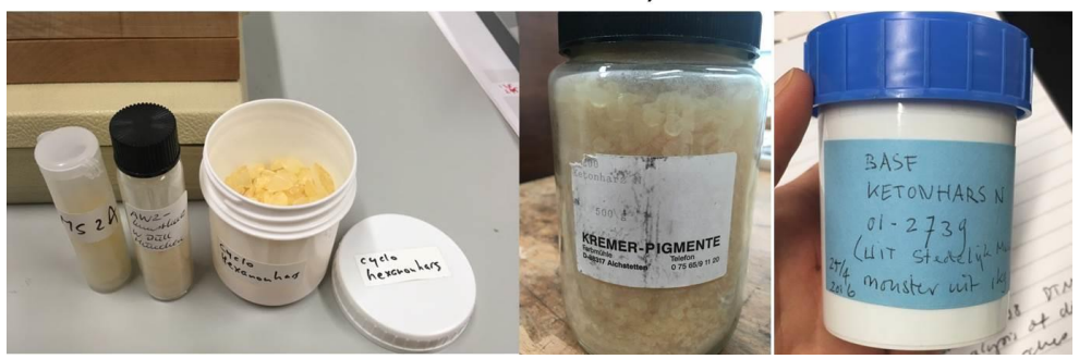
Collection of old varnishes and ketone resins from SMK, Copenhagen