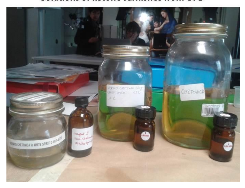
Ketone resins from RCE, Amsterdam