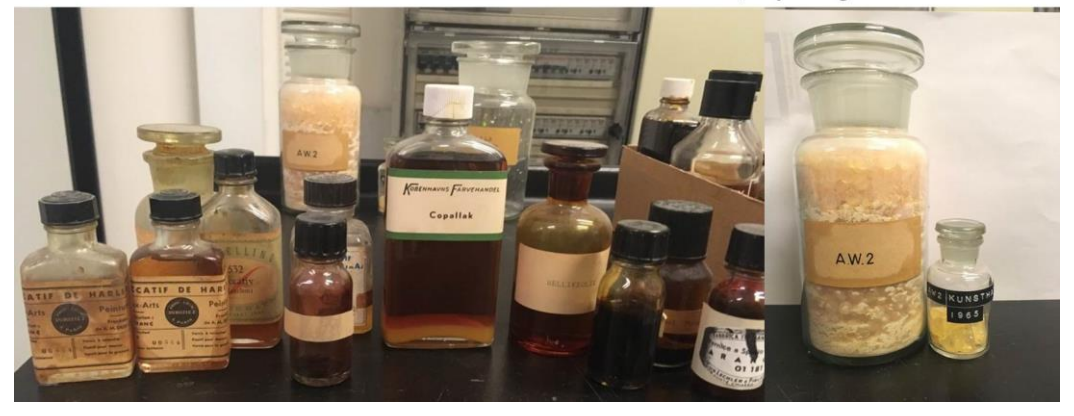
Fig. 4 . Images of the reference materials in the 3 institutions where ketone resins or solutions of varnish were found

Table 1 gives all the samples of ketone resins gathered during the Access in form of beads or bottles with solutions.