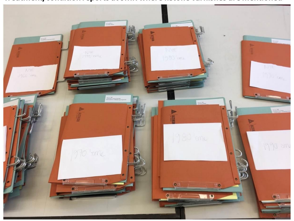
Fig. 3. Documentation consulted during the Access to SMK archive